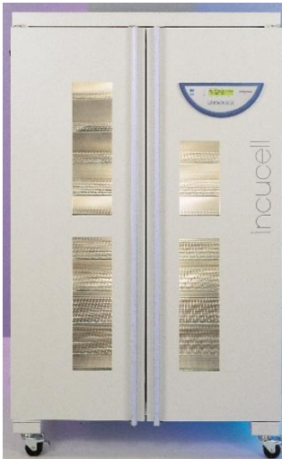
Incucell 707 w/ optional glass window

The Incucell natural convection is designed for the safe treatment of microbiological cultures. The Incucells' soft natural gravity air convection greatly reduces particle movement.