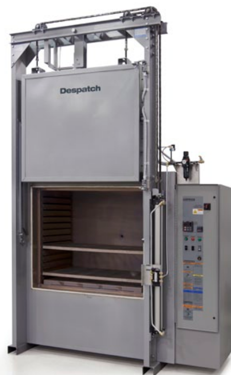
RAF2-35 with optional pneumatic lift door